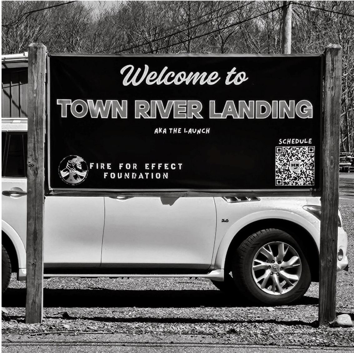
Fire For Effect Foundation 80 Spring Street, Bridgewater, MA