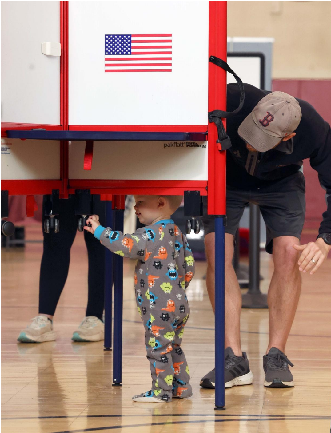
Presidential Election, November 5, 2024 Edward J. O'Donoghue Middle School